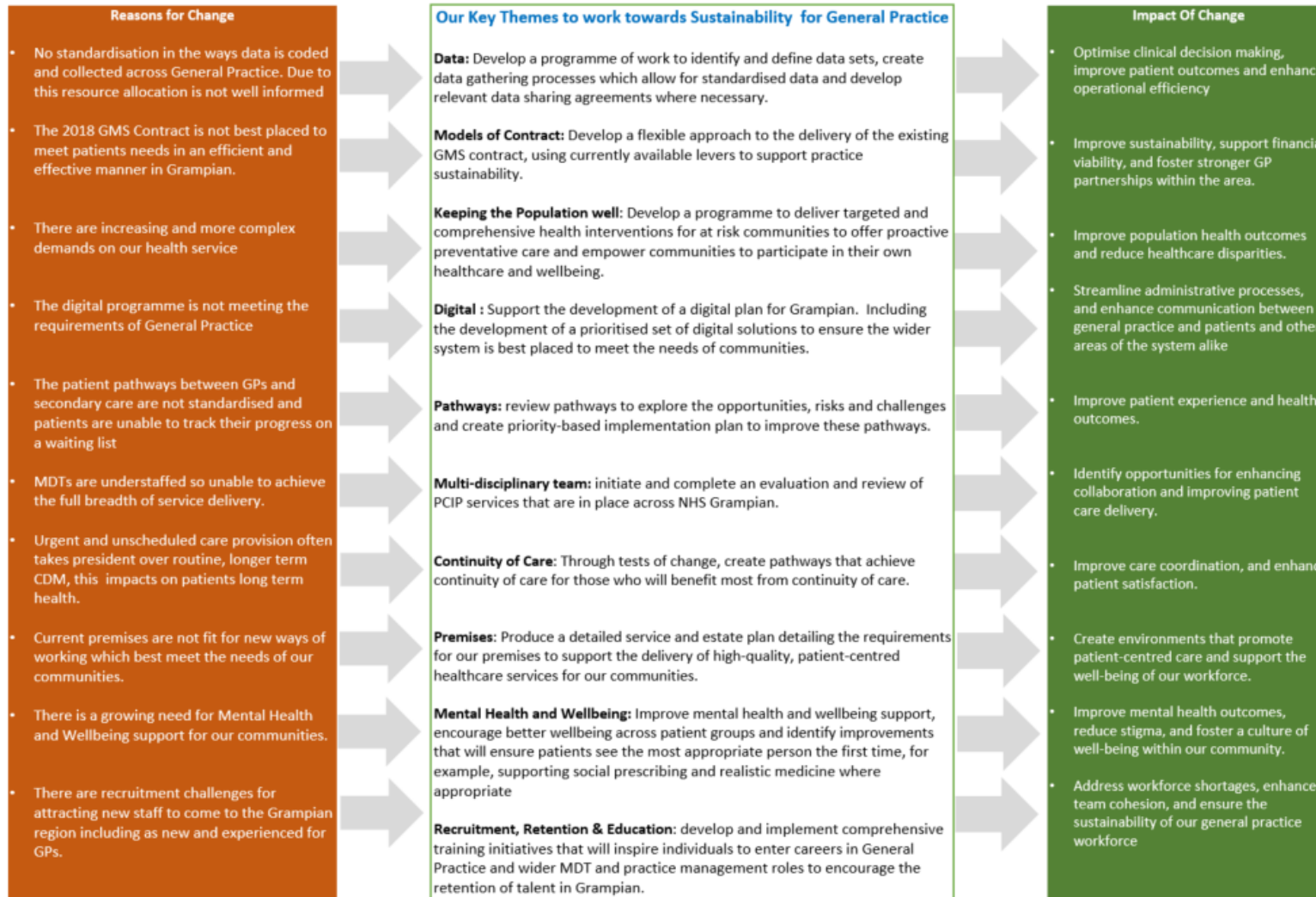
Table: 2 Reasons for Change, Key themes and Impact of Change