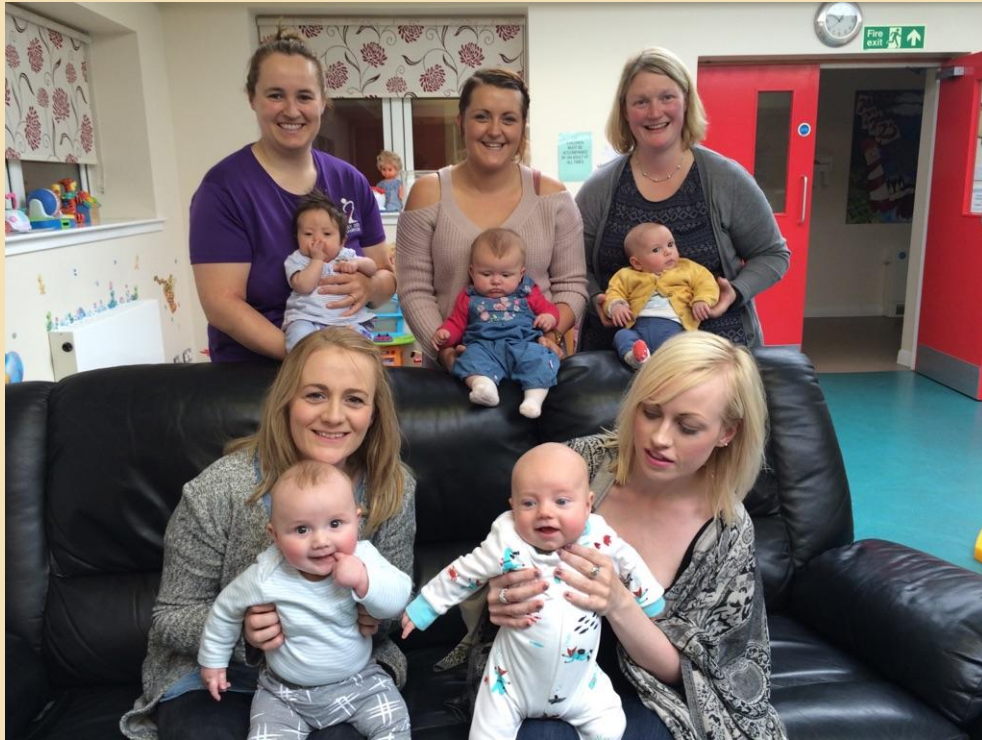
Orcadian babies and their mums giving their views on The Baird Family Hospital plans

Feedback from both visits will contribute towards the final designs for both buildings as well as the service redesign agenda. The project team is grateful to everyone for their contributions.