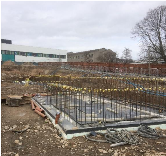
The beginning of a staircase on the ANCHOR site

Works are again progressing well; piling works have been completed and the piling rig is now off-site. A series of 'pile strength tests' have been carried out to ensure they are in compliance with the design engineer's data.