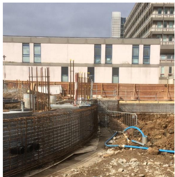
The start of a wall on the Baird site showing the curve of the building