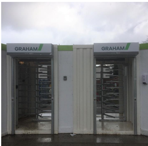
Biometric gates operational on both sites

Biometric access controlled gates are now in place and operational at both sites. These serve as a means of ensuring that only personnel who have undertaken a site induction can access the site.