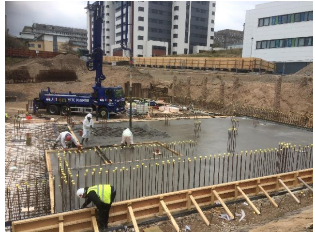
First concrete floor poured on the ANCHOR site

Radiotherapy building at ground floor level. These works are critical to allow other trades to carry out the work that they are responsible for. The steelworker has been busy making the reinforced iron cages which are then placed on top of the piles prior to concrete pours taking place.