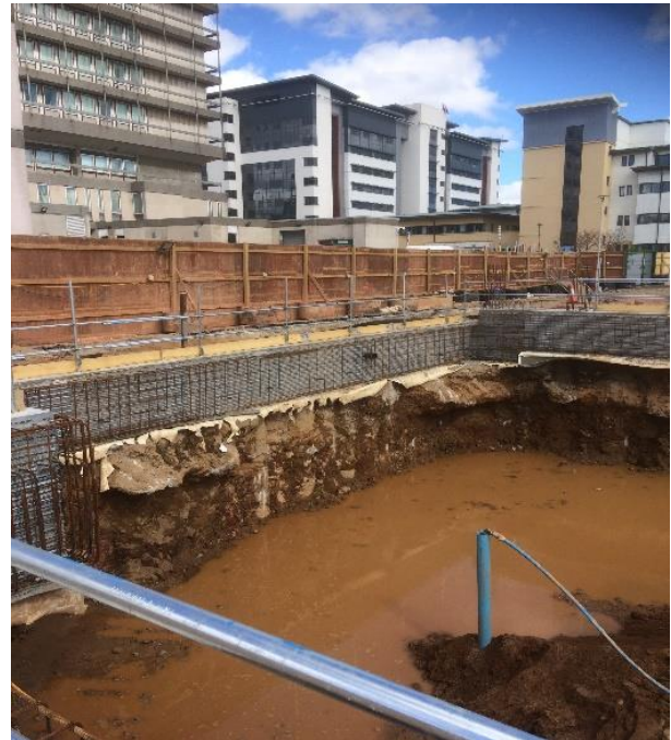
Preparation work for Baird lower ground floor

about 30 lorries a day are removing soil from this area. When this has been completed it will allow the piling rigs to move in and carry out the required work in that area.