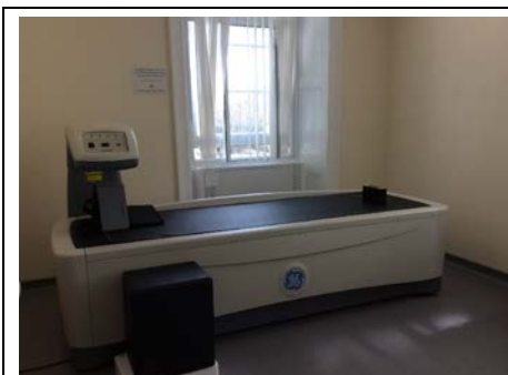
A DXA scanner

The DXA scanner is in the Outpatient Department, Dr Gray's Hospital, Elgin, IV30 1SN.