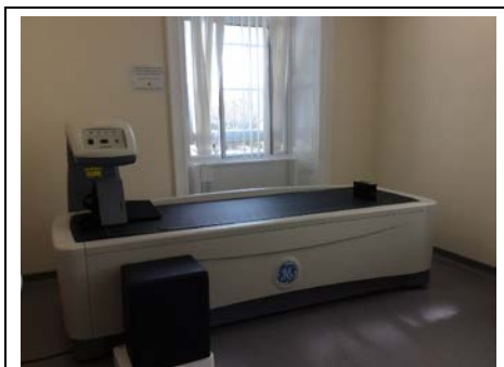
A DXA scanner

The DXA scanners are situated at the Grampian Osteoporosis Service, Ground Floor, Ashgrove House, Foresterhill, Aberdeen, AB25 2ZA. We also have a mobile DXA scanner.